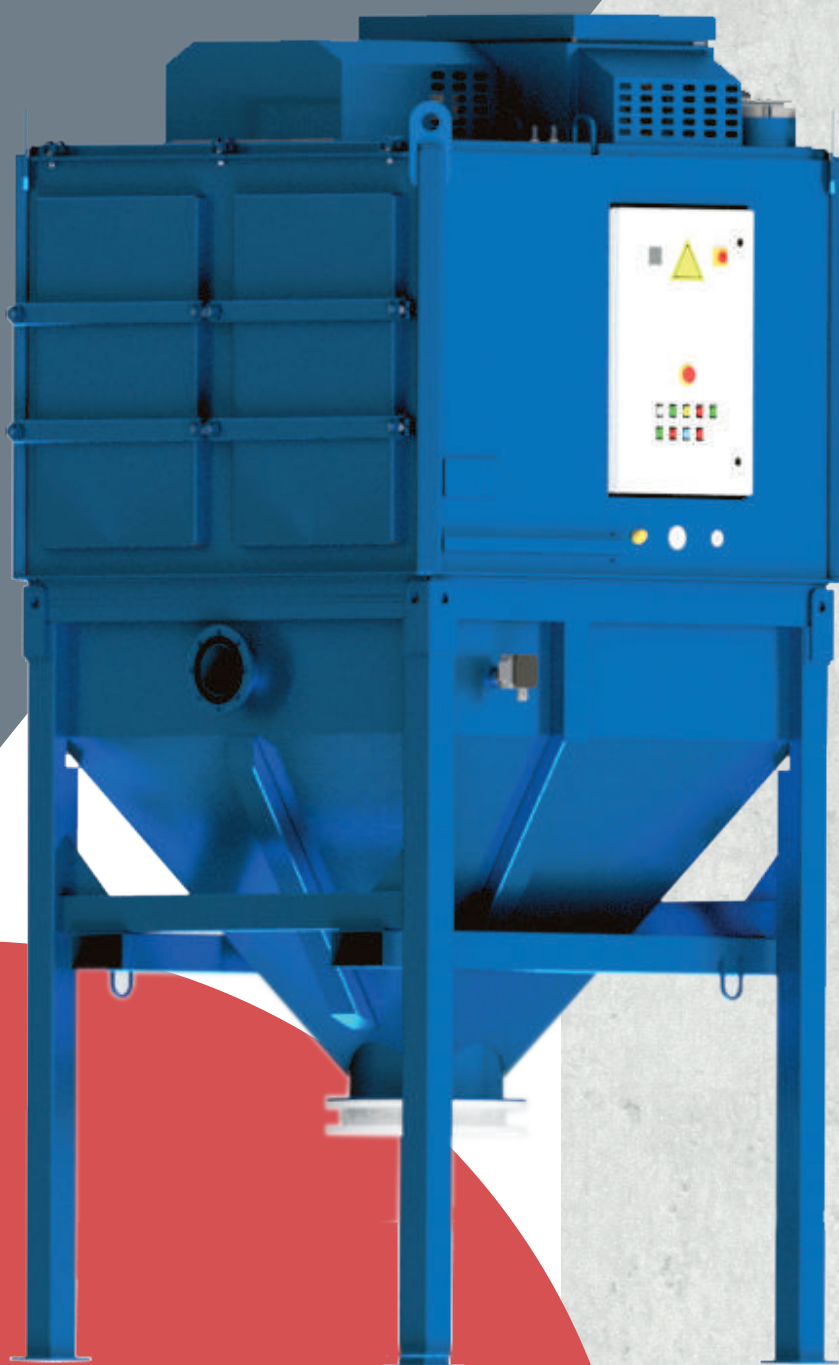
SL / 22 / 65

Powerful, strong and productive. SL and DL were born to handle any challenge. Resistant to stress and abrasion, made with a 5 mm thick metal. Low maintenance, extraordinary results.