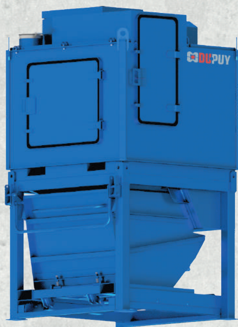
DL / 22 / 65

Connected to a 1000 lt capacity container. Power and mobility !